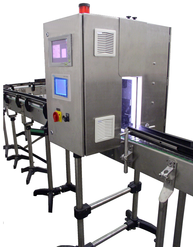
EXAN VIEW - Marien Brunnen Erfrischungsgetränke GmbH, Germany