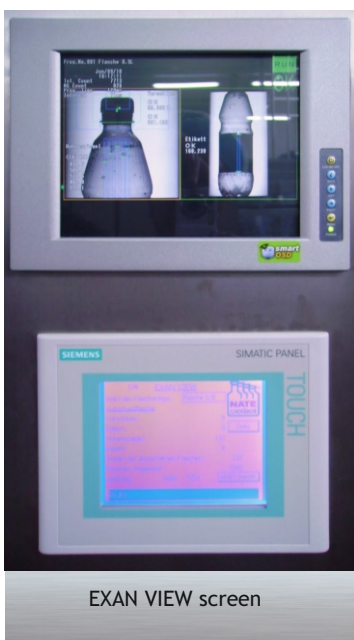
EXAN VIEW screen